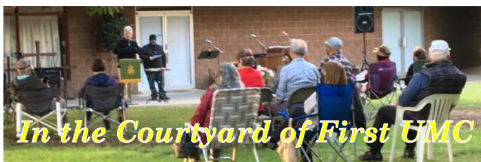
In the Courtyard of First UMC

This year our Christmas Eve Service will be outside in the Courtyard of First UMC at 4:00 p.m. on Thursday, December 24.