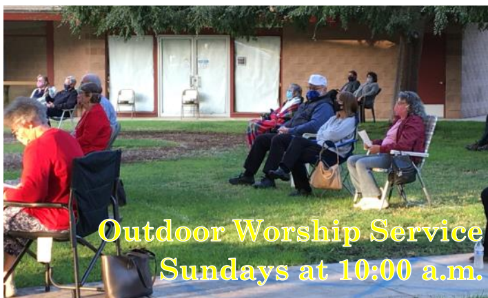
Outdoor Worship Service Sundays at 10:00 a.m.